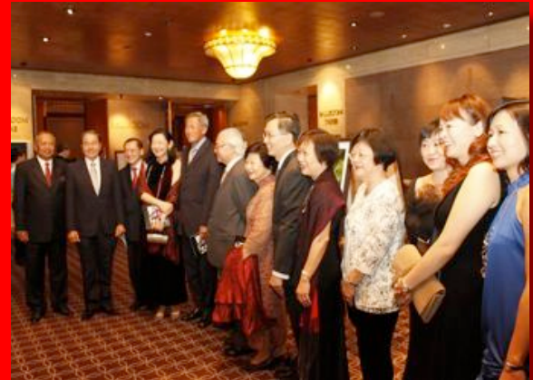
The Welcoming party with VVIPs