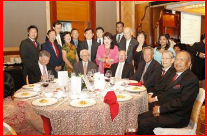
Supporters from Sarawak Australian Graduates Alumni and Malaysia Australia Federation with VVIPs