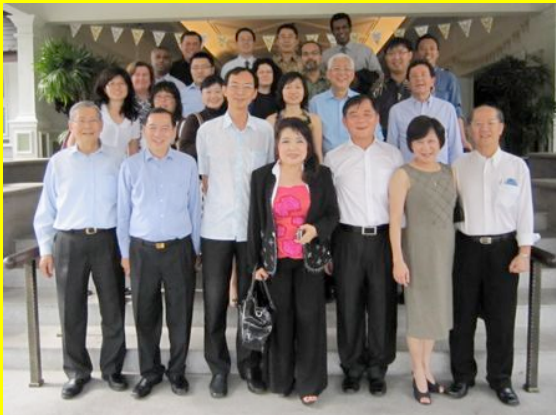
Fellowship at the Sarawak Club

The evening meal was held at Lot 101 where we were introduced to authentic local Kuching delights. With light breezes blowing, the setting was perfect for the outdoor feast. We sampled all the different types of noodles from “kolo mee” to “Sarawak laksa”, different varieties of “pangang fish”, BBQ chicken, satay, rojak and ended with “buboh cha-cha” and “yuan” dessert. We had been eating non-stop since our arrival. We wrapped up the evening with karaoke at a social club. All too soon, we had to take our leave as we had an early flight to catch the next morning.