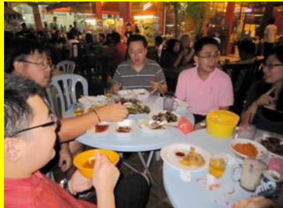
Food, glorious food..... Busy tucking-in