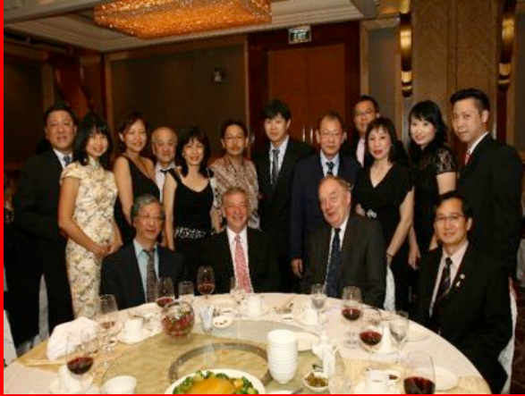
Supporters from the Adelaide University Alumni Association