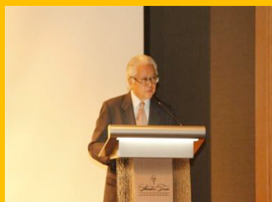
Address by Dr Tony Tan, first recipient of Distinguished Australian Alumnus Award