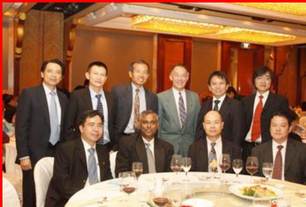
Supporters from Alumni International Singapore