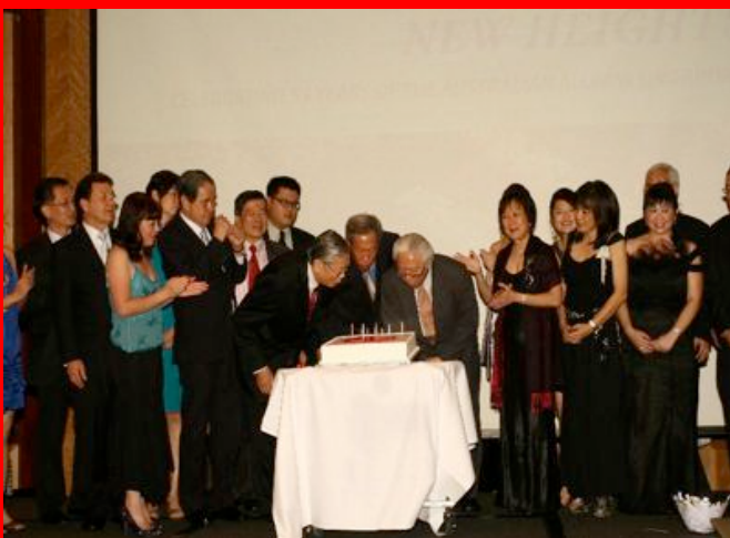
Happy 55 th Anniversary, Australian Alumni Singapore!